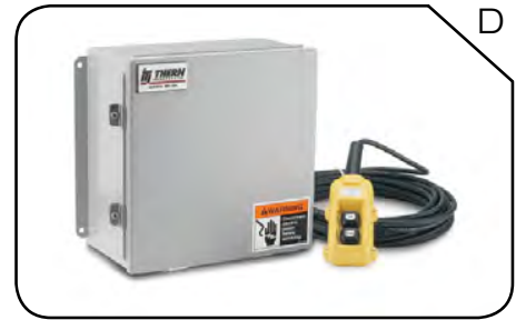
Custom controls available for special applications.

TORQUE LIMITERS as part of the motor controls.