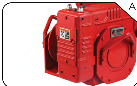
Mechanical brake for lifting applications.

2 YEAR MOVE IT WITH CONFIDENCE LIMITED WARRANTY leads the industry.