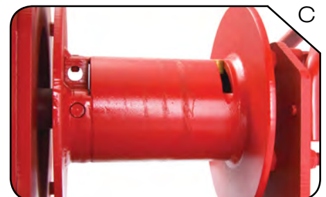
Drum features a set screw slot (left) and keyhole slot (right).