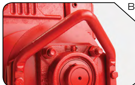
Lifting handles provide easy attachment points for lifting straps.